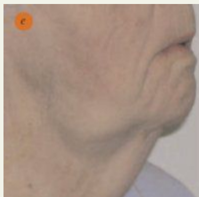
(e) a mass or lump in the neck