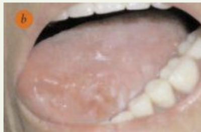
(b) red and white patches — erythroleukoplakia