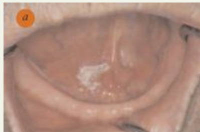
(a) white patches of the oral tissues — leukoplakia